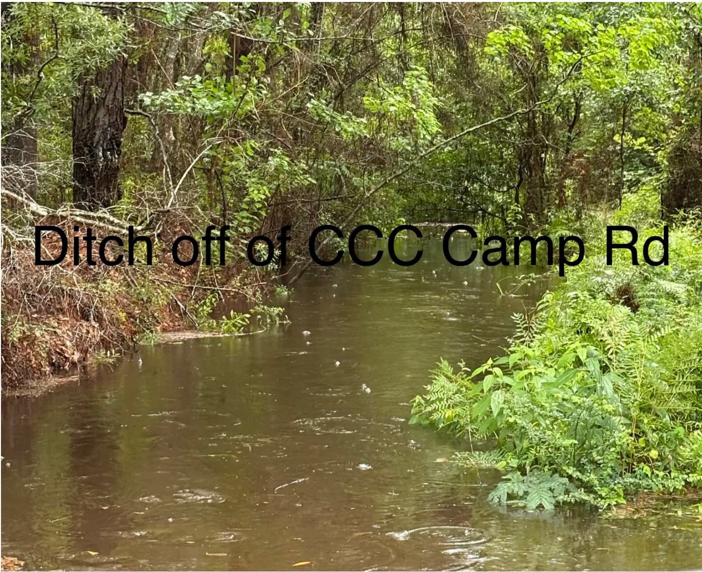
Ditch off of CCC Camp Rd