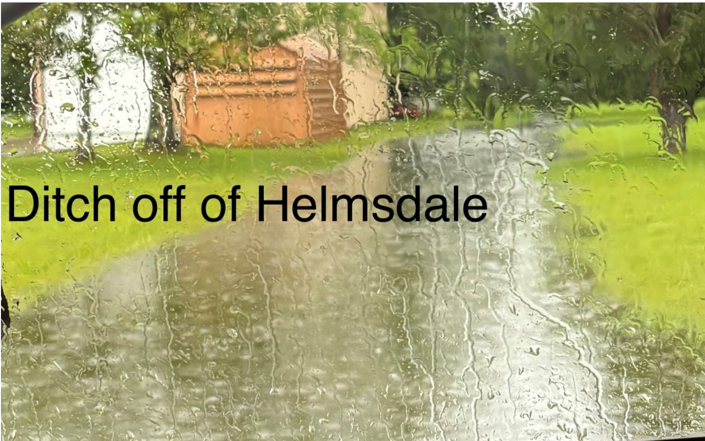
Ditch off of Helmsdale