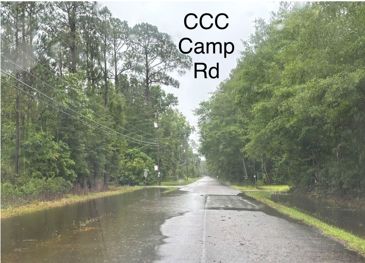
CCC Camp Rd