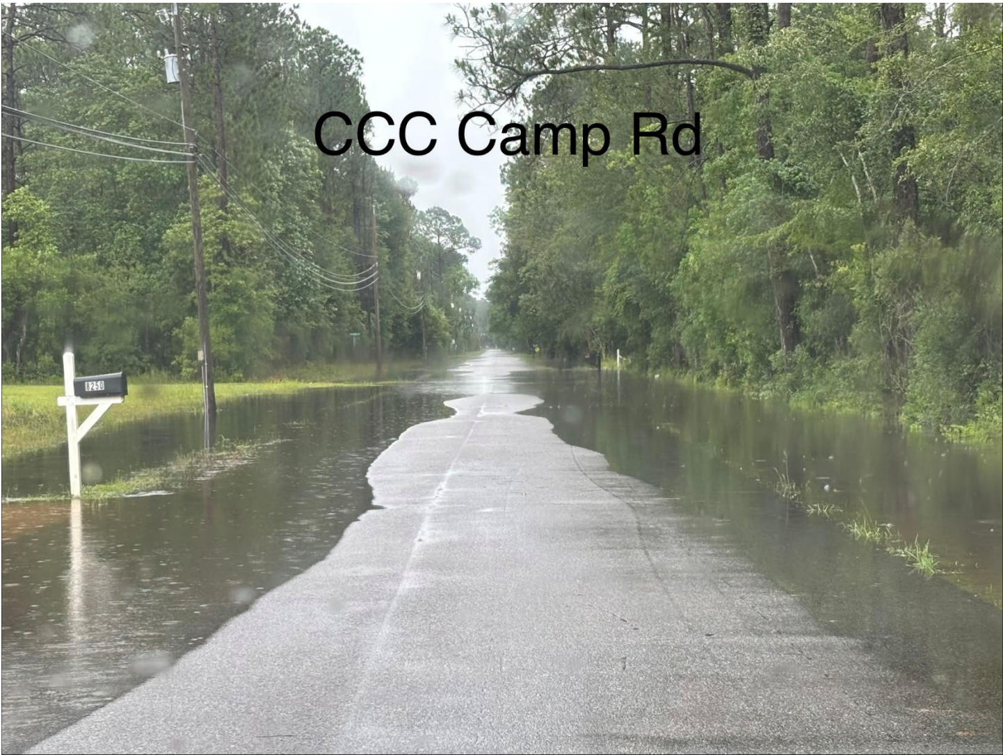
CCC Camp Rd