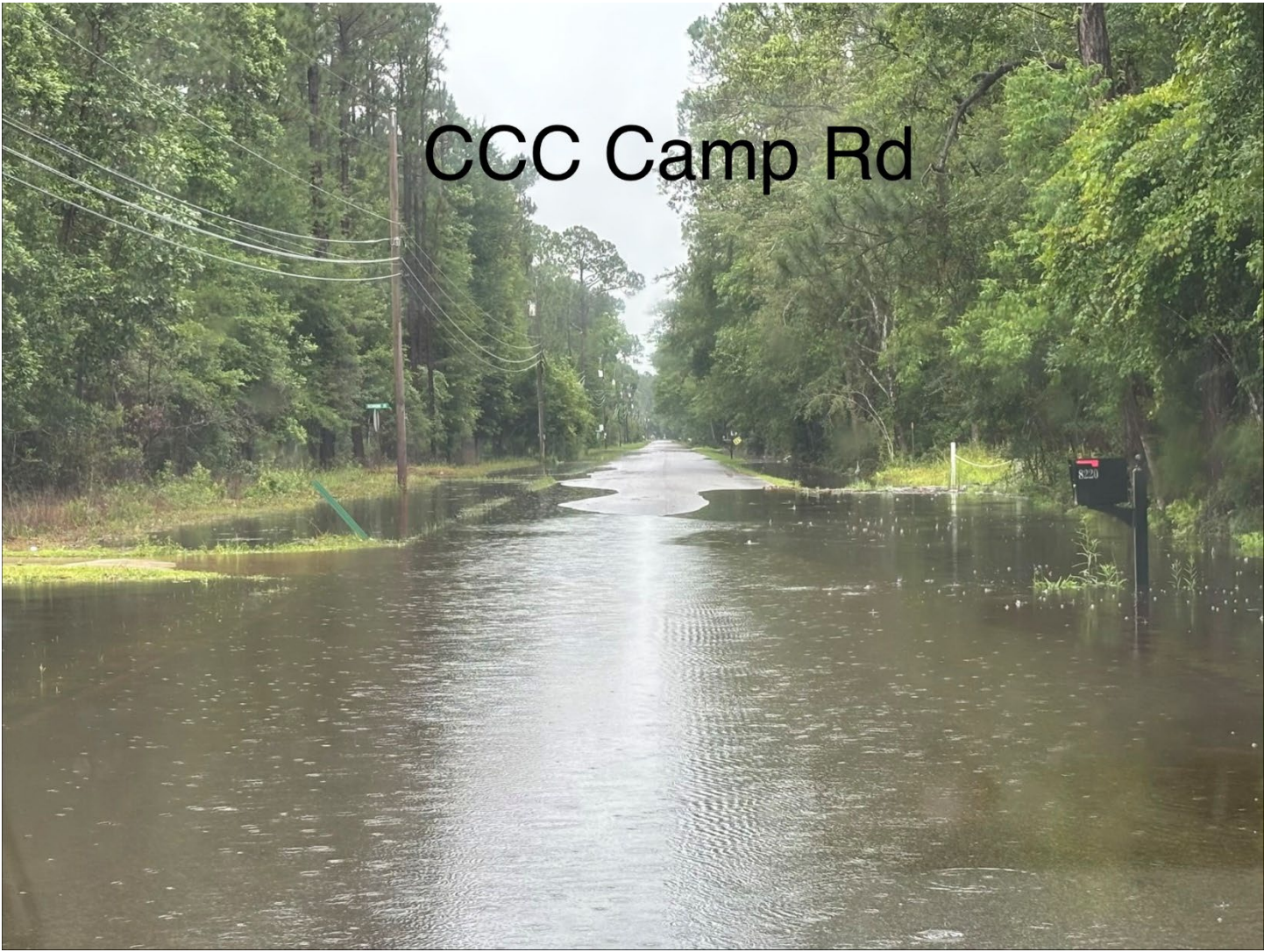
CCC Camp Rd