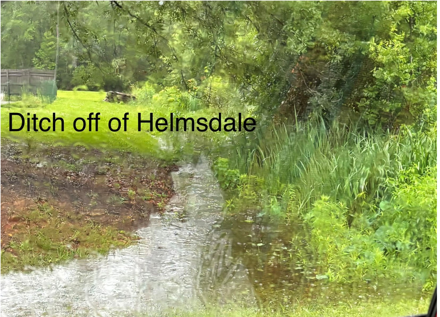
Ditch off of Helmsdale