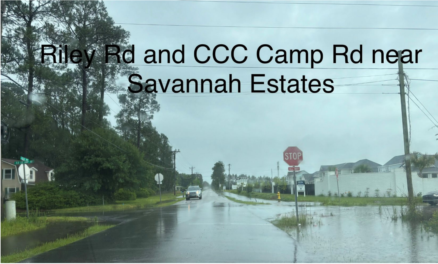
Riley Rd and CCC Camp Rd near Savannah Estates